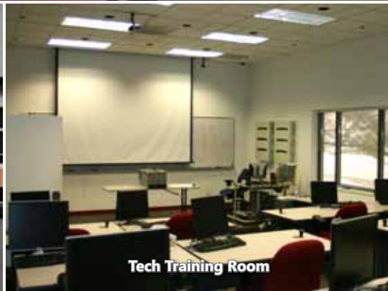
Tech Training Room