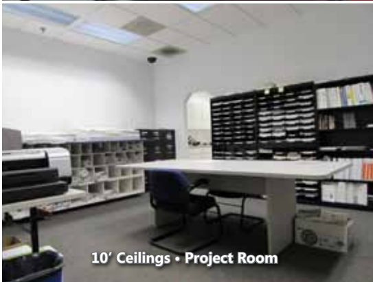
10' Ceilings • Project Room